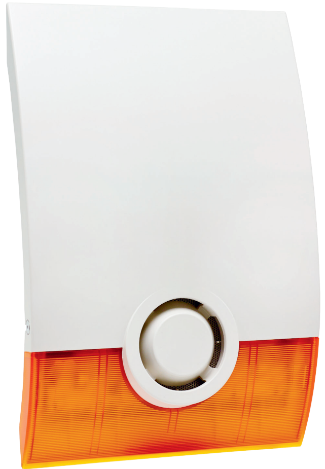
Orange Flash OSX 200 & OSX 601