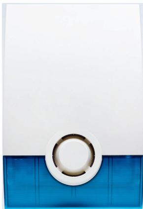
Blue Flash OSX 210 & OSX 712

Visual and audible signalisation of alarms in Videofied security systems