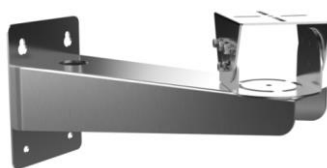
DS-1701ZJ Wall Mounting Bracket